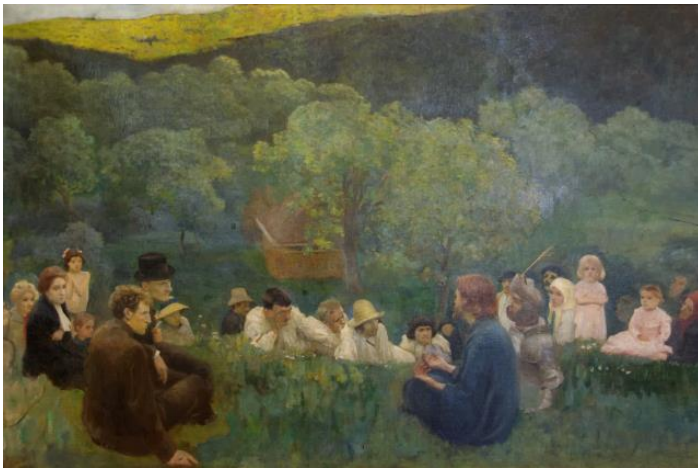
Károly Ferenczy Sermon on the Mountain