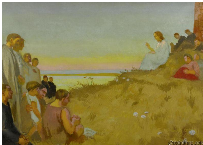
Maurice Denis Sermon on the Mount

Take my voice and let me sing always, only, for my King; take my lips and let them be filled with messages from thee, filled with messages from thee.