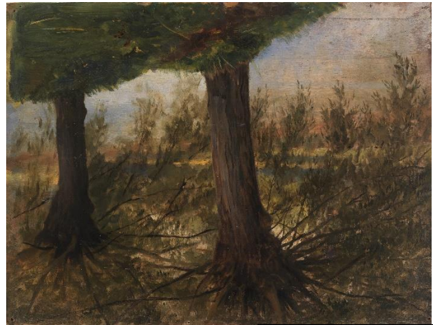
Eliphalet Andrews Trees Beside a Stream

Oh, the joys of those who walk not after the advice of the wicked, nor stand in the path of sinners, nor sit in the seat of scoffers, 2 but delight in the law of Yahweh and ponder it day and night. 3 They are like trees planted by streams of water that yield fruit in due season, whose leaves do not wither; and everything they do prospers. 4 The ungodly are not so but are like chaff which the wind blows away. 5 Therefore, they cannot stand when Judgment comes, nor shall sinners find a place in the assembly of the righteous. 6 For God knows the ways of the just, but the way of the ungodly ends in ruin.