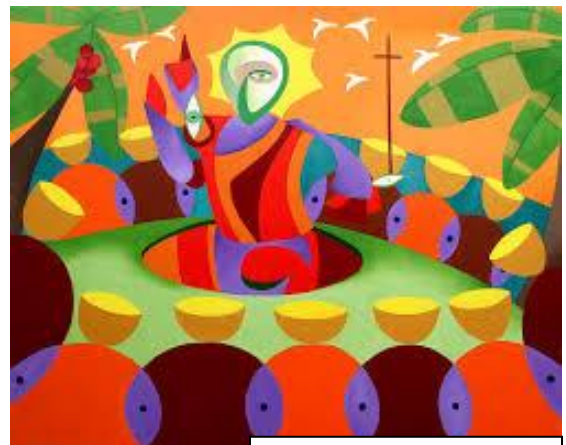
Andy Gonzales The Sermon on the Mount

Grant us the peace that comes with your presence, that we can have the strength to keep going.